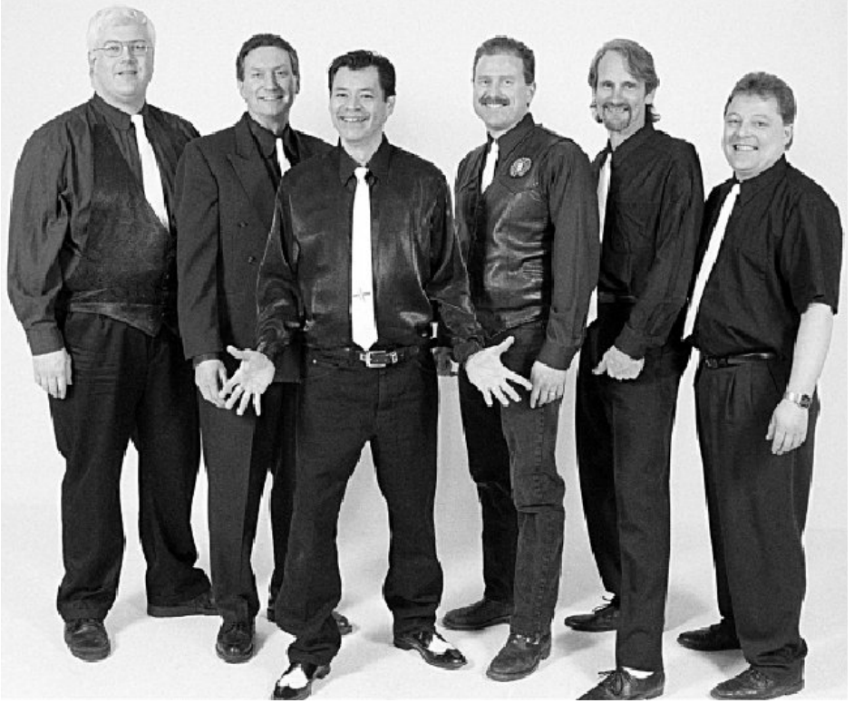
The Fabulous Oldies But Goodies Band will be next up at Swingin' at the Shell this coming Sunday, August 10, at 7 p.m. You won't want to miss them! Swingin' at the Shell is presented by